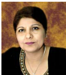
Dr Shamshad Akhtar Governor State Bank of Pakistan