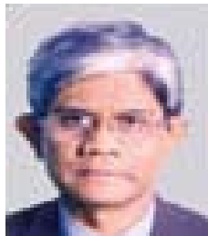
Dr Salehuddin Ahmed Governor Bangladesh Bank