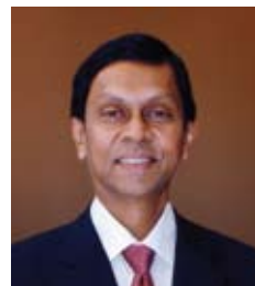
Mr Ajith Nivard Cabraal Governor Central Bank of Sri Lanka