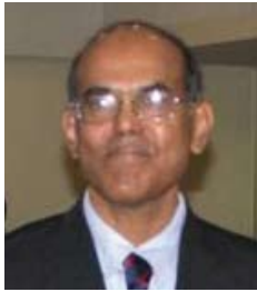
Dr D Subbarao Chairman Governor, Reserve Bank of India